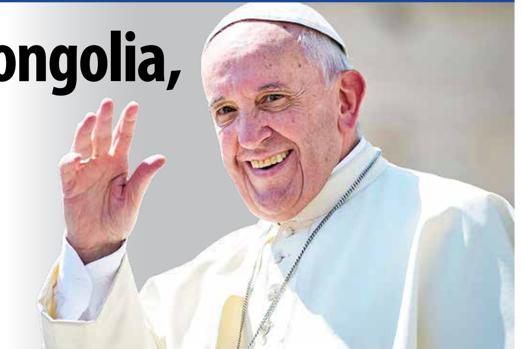
The MONGOL MESSENGER wishes His Holiness Pope Francis a pleasant and memorable Visit to Mongolia.