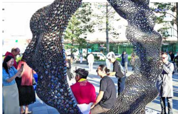
"Arts & Media Project Management & Consulting" NGO in cooperation with NordArt as an official partner organized the first "MongolianArt" International Sculpture Symposium by hosting internationally renowned artists and sculptors in the Gorkhi-Terelj National Park on August 21, 2023.